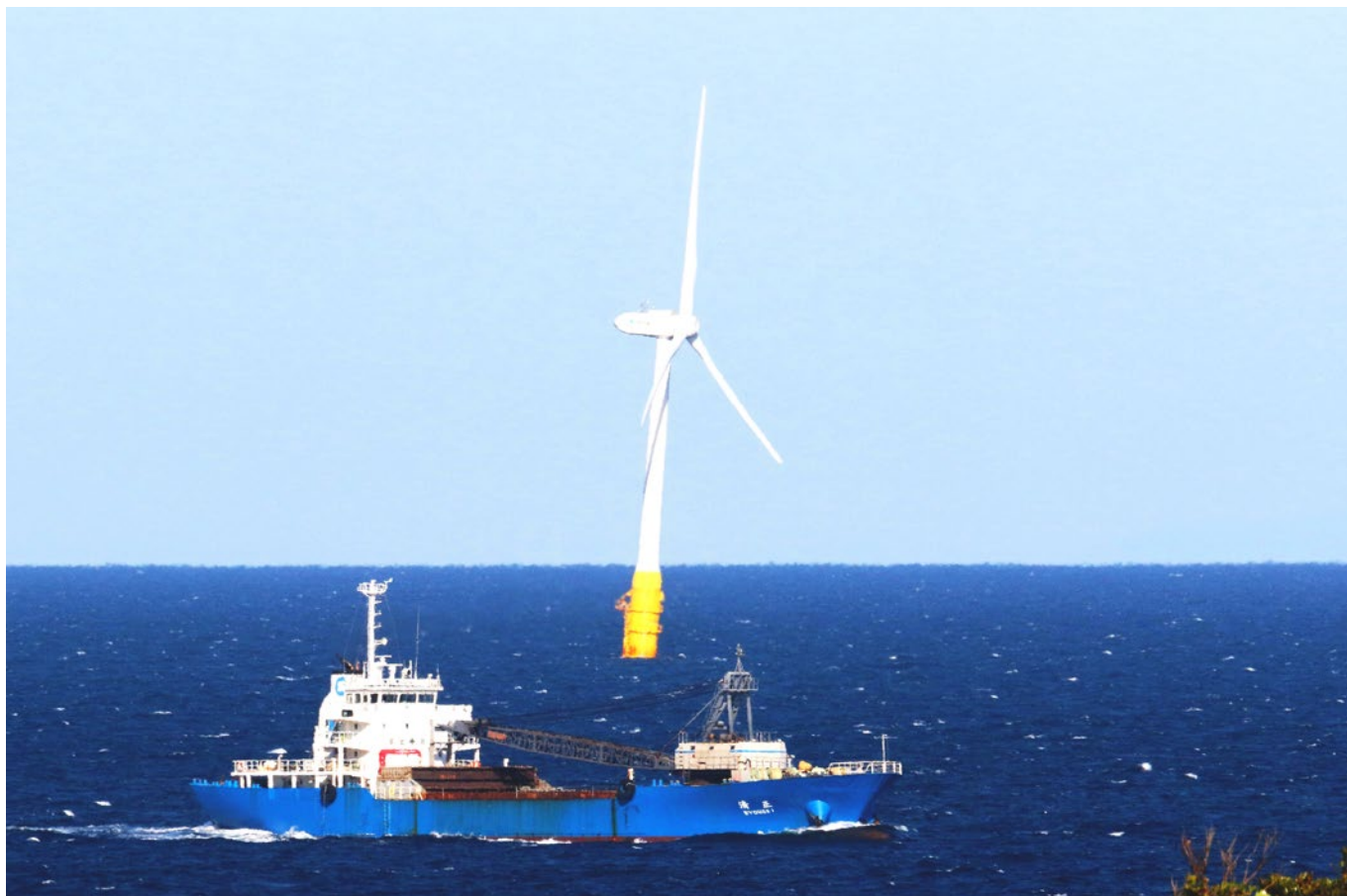
A floating wind turbine is set up by Goto City and Toda Corporation at the Goto Islands in Nagasaki prefecture (October 2020).