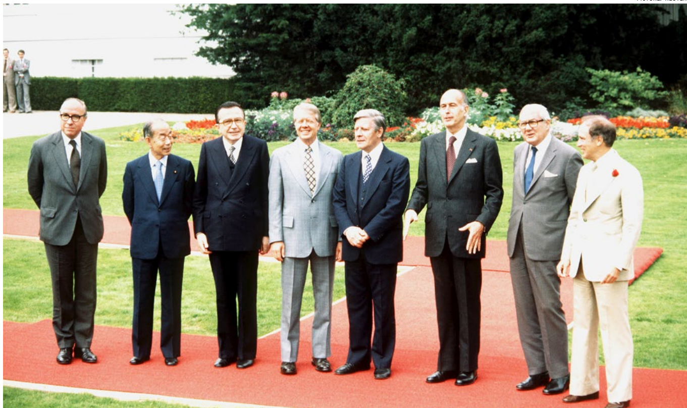
Japanese prime minister Takeo Fukuda pictured with EU commission president Roy Jenkins, Italian president Giulio Andreotti, US president Jimmy Carter, German chancellor Helmut Schmidt, French state president Valery Giscard d'Estaing, British prime minister James Callaghan and Canadian prime minister Pierre Trudeau (16 July 1978).