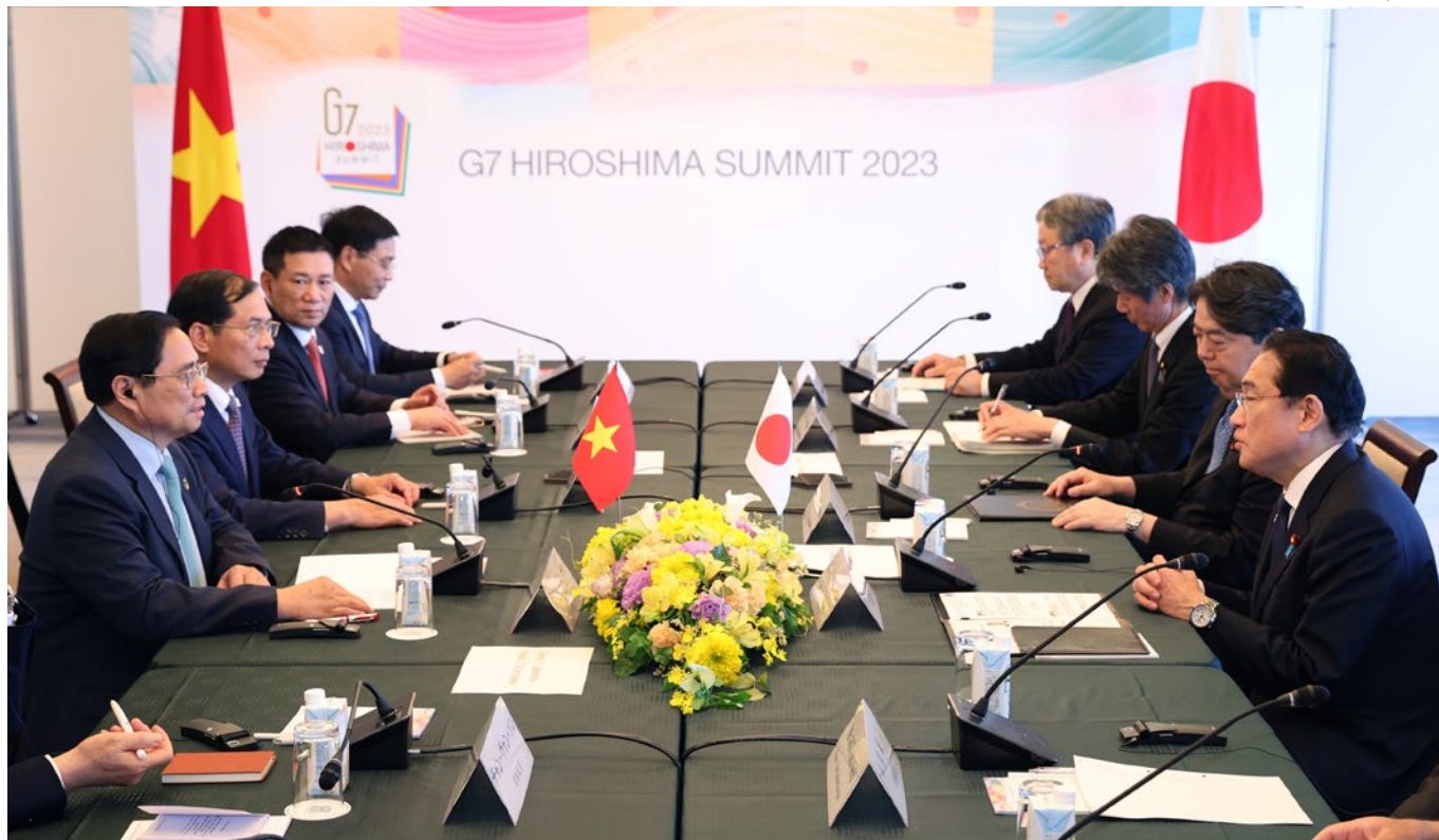
Japanese Prime Minister Fumio Kishida and Vietnam's Prime Minister Pham Minh Chinh meet during the Hiroshima G7 summit (May 2023).