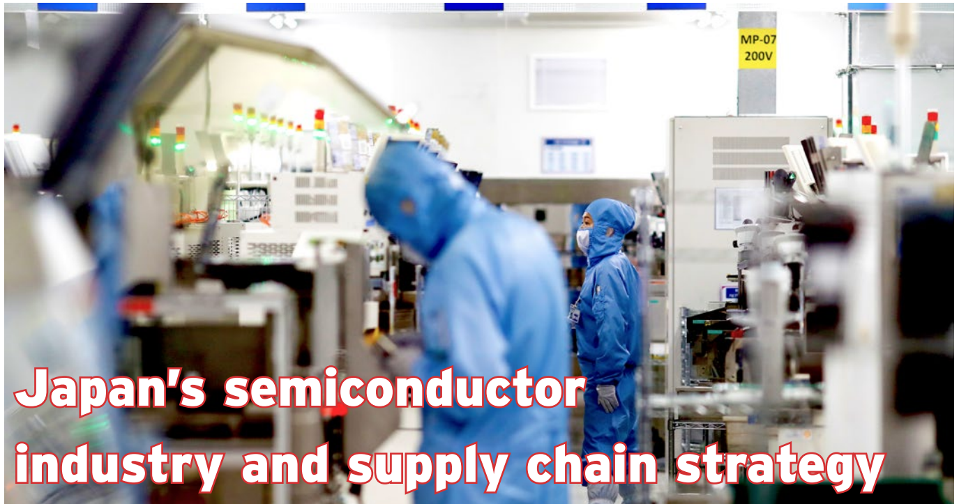
Employees work at a Beijing plant operated by the Japanese semiconductor and microchip manufacturing company Renesas (May 2020).