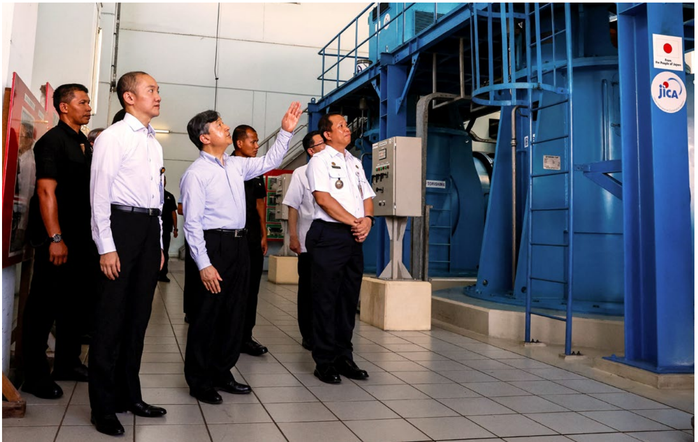
Japan's Emperor Naruhito and an expert from the Japan International Cooperation Agency visit Jakarta's Pluit water pumping facility, which has received Japanese government funding for a critical renovation (June 2023).