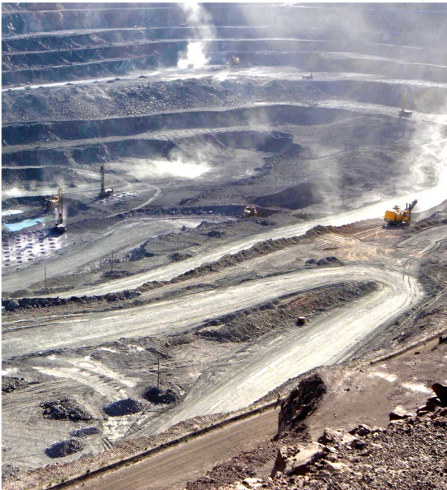
China's Bayan Obo mine in Mongolia, the world's largest rare earth mine, has been operating since 1957.