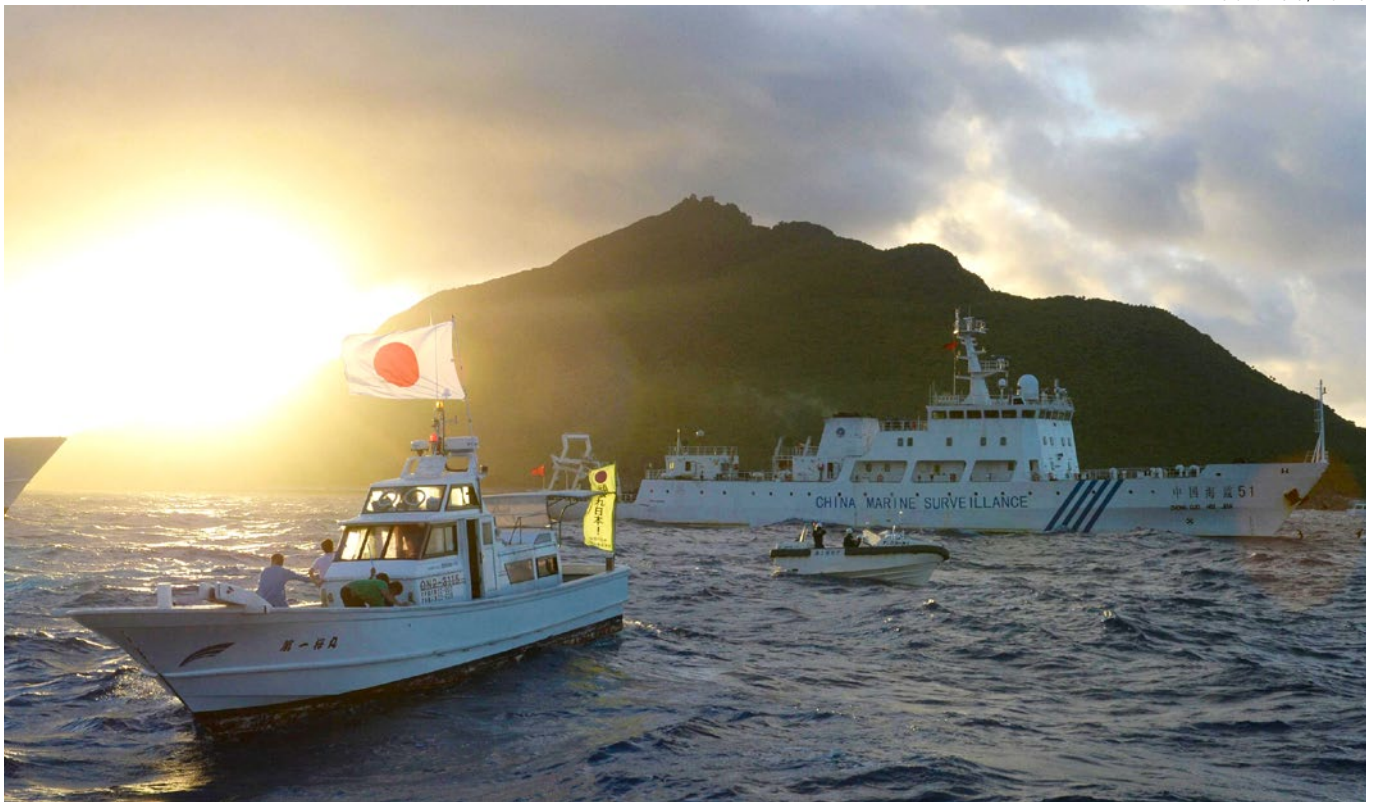
A Chinese surveillance ship sails near Japan Coast Guard vessels and a Japanese fishing boat near one of the disputed Senkaku/Diaoyu islands (July 2013).