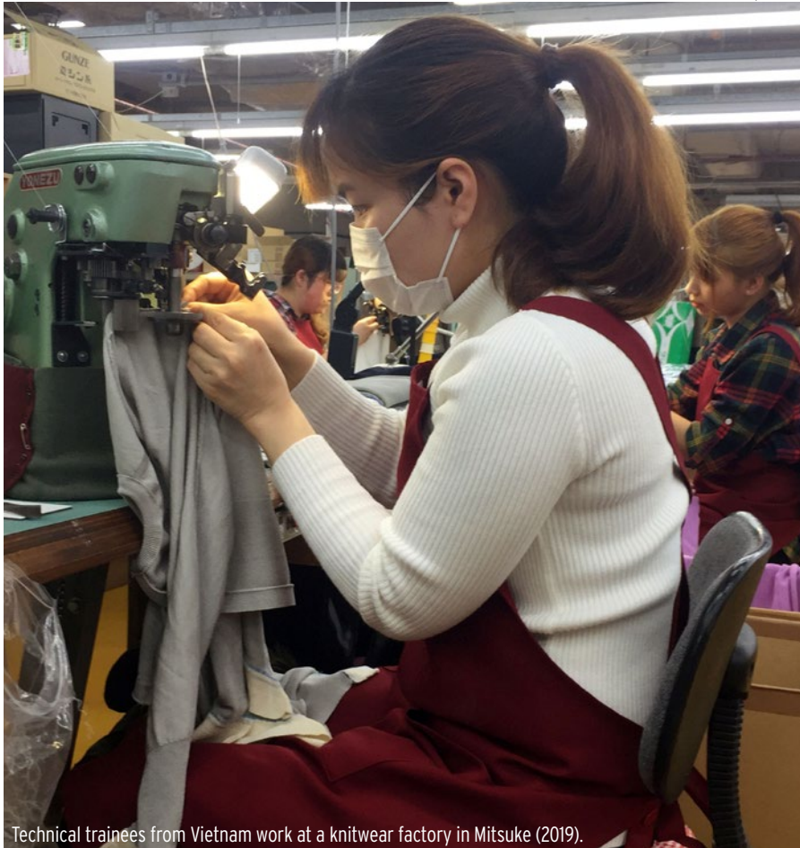
Technical trainees from Vietnam work at a knitwear factory in Mitsuke (2019).