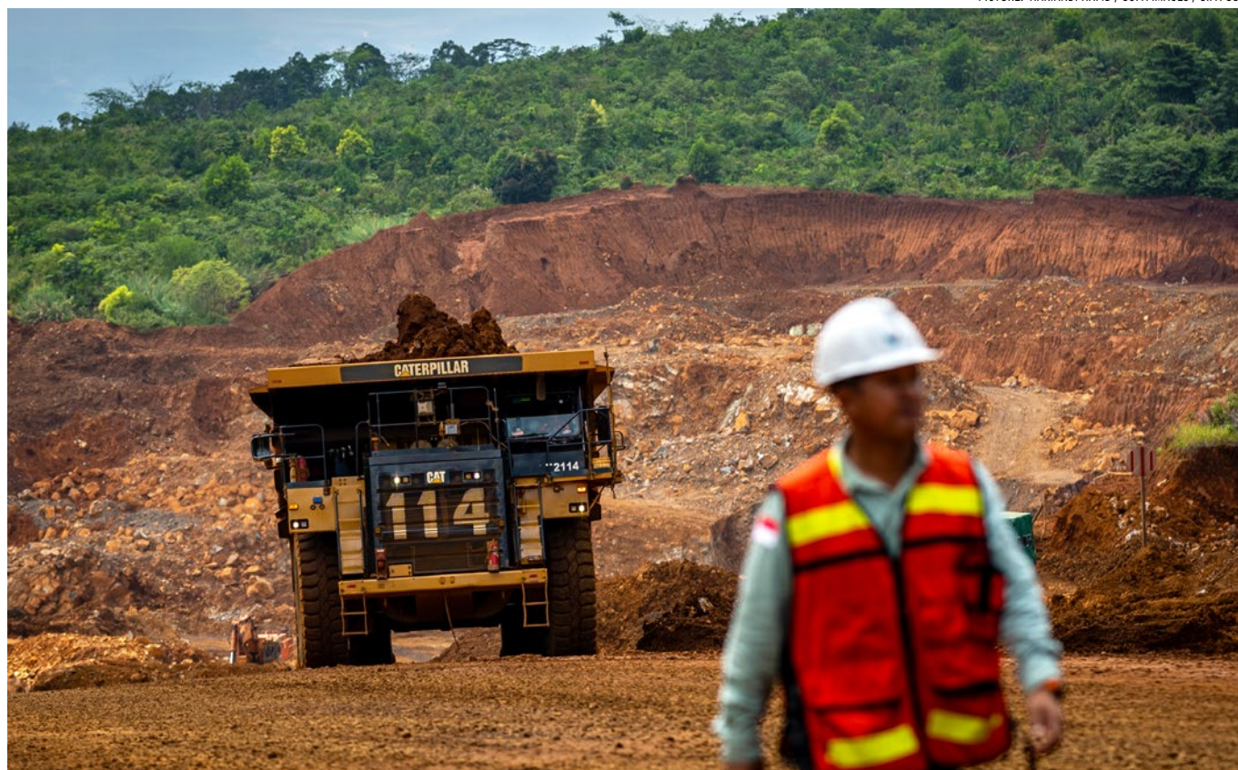
Workers extract nickel at PT Vale's Sorowako mine, one of Indonesia's largest reserves of nickel.