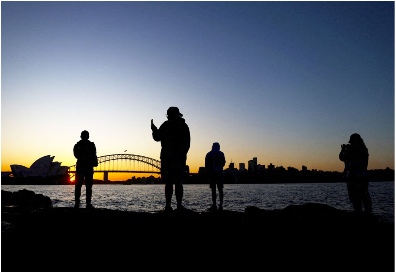
People using their smartphones enjoy a sunset view of the Sydney Opera House and Harbour Bridge ahead of the FIFA Women's World Cup (July, 2023).